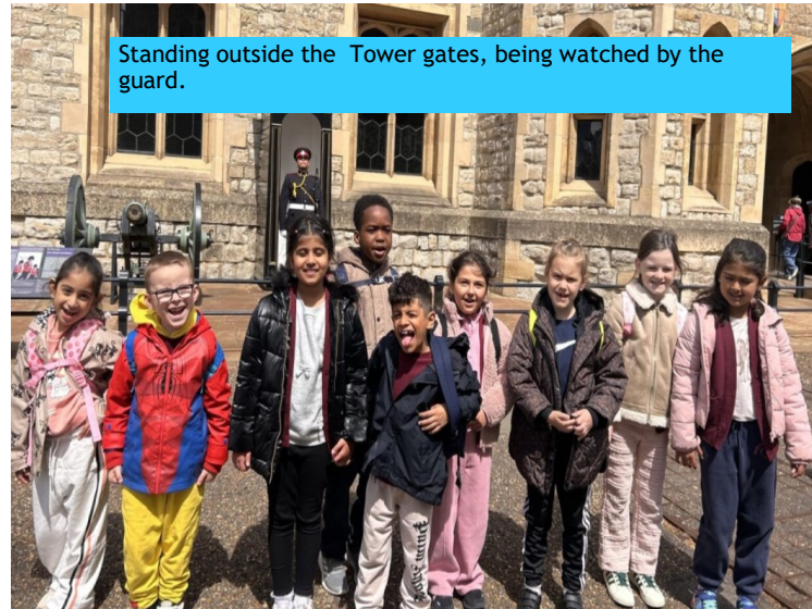
Standing outside the Tower gates, being watched by the guard.