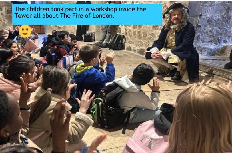
The children took part in a workshop inside the Tower all about The Fire of London.