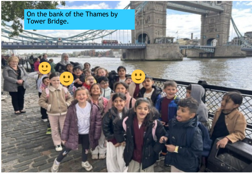
On the bank of the Thames by Tower Bridge.