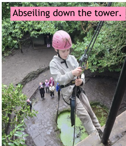
Abseiling down the tower.