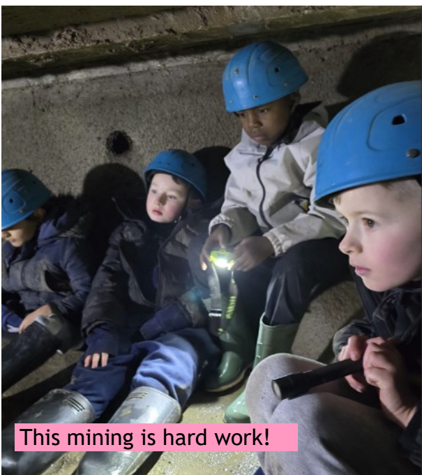
This mining is hard work!