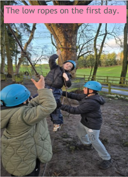
The low ropes on the first day.