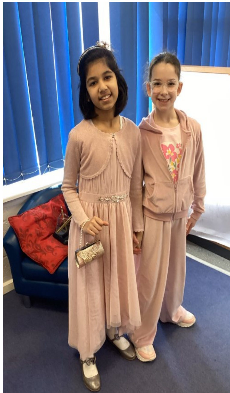
Lady Haversham and other amazing book characters. What characters can you see?